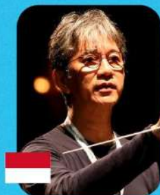
Budi Utomo Prabowo INDONESIA